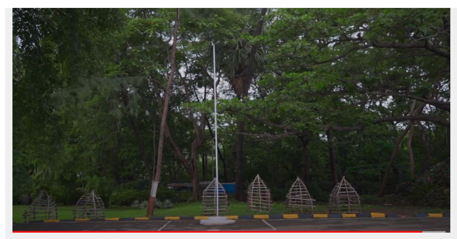
Flag Pole Road with Dome Pillar Corridor & Wooden Rest House